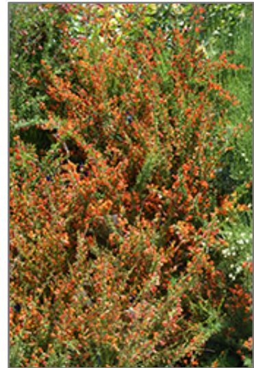
Lena Scotch Broom in bloom

This shrub should only be grown in full sunlight. It prefers dry to average moisture levels with very well-drained soil, and will often die in standing water. It is considered to be drought-tolerant, and thus makes an ideal choice for xeriscaping or the moisture-conserving landscape. It is particular about its soil conditions, with a strong preference for clay, alkaline soils, and is able to handle environmental salt. It is highly tolerant of urban pollution and will even thrive in inner city environments. This particular variety is an interspecific hybrid.