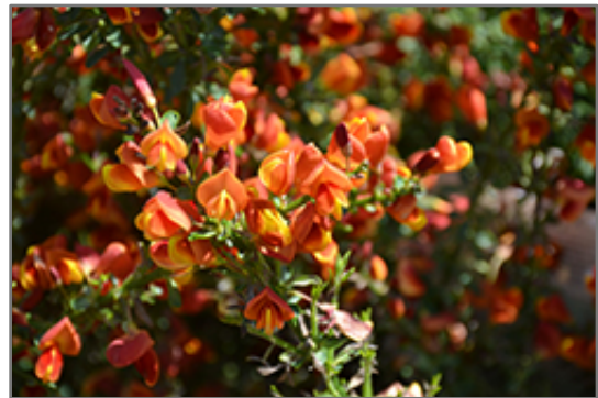
Lena Scotch Broom flowers