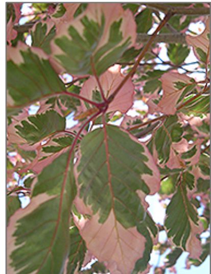
Tricolor Beech foliage