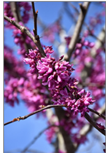
Eastern Redbud (tree form) flowers