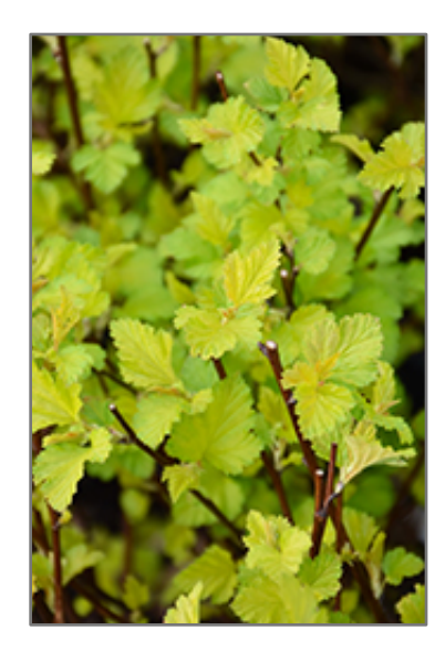
Nugget Ninebark foliage

Nugget Ninebark is recommended for the following landscape applications;