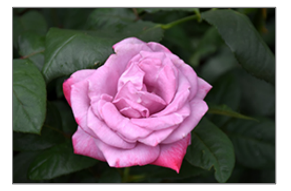
Paradise Rose flowers

This shrub will require occasional maintenance and upkeep, and is best pruned in late winter once the threat of extreme cold has passed. Gardeners should be aware of the following characteristic(s) that may warrant special consideration;