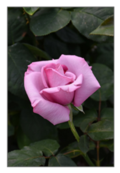
Paradise Rose flower buds