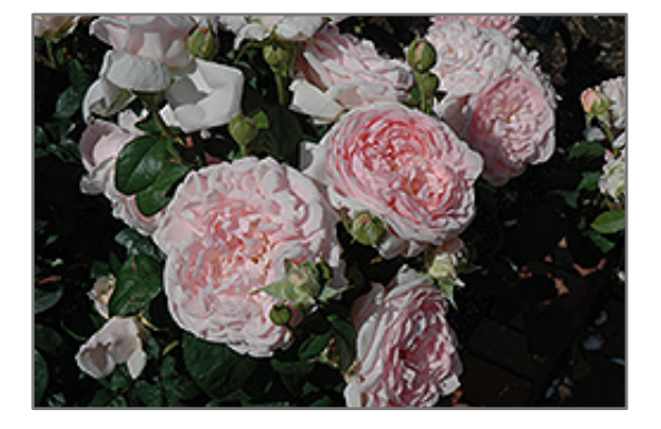
Eglantyne Rose flowers

93 East Main Street Hopkinton MA 02148 - (508) 435-3414 160 Pine Hill Road Chelmsford MA 01824 - (978) 349-0055 COMMERCIAL: commsales@westonnurseries.com - (508) 293-8028