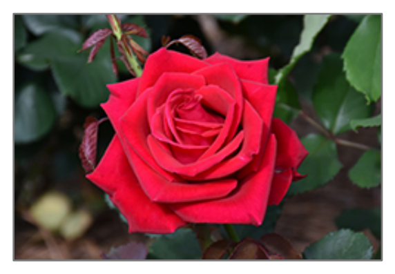
Veteran's Honor Rose flowers

93 East Main Street Hopkinton MA 02148 - (508) 435-3414 160 Pine Hill Road Chelmsford MA 01824 - (978) 349-0055 COMMERCIAL: commsales@westonnurseries.com - (508) 293-8028