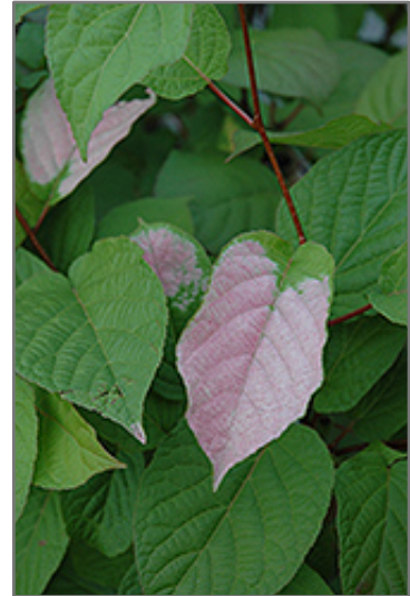
September Sun Kiwi foliage

September Sun Kiwi is recommended for the following landscape applications;