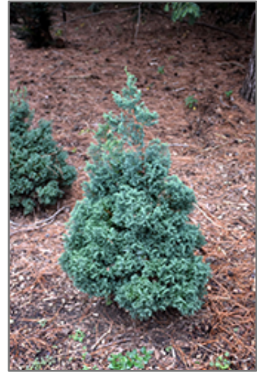
Blue Feathers Hinoki Falsecypress

This shrub does best in full sun to partial shade. It prefers to grow in average to moist conditions, and shouldn't be allowed to dry out. It is not particular as to soil type or pH. It is highly tolerant of urban pollution and will even thrive in inner city environments, and will benefit from being planted in a relatively sheltered location. Consider applying a thick mulch around the root zone in winter to protect it in exposed locations or colder microclimates. This is a selected variety of a species not originally from North America.