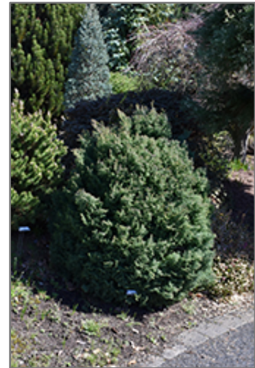
Blue Feathers Hinoki Falsecypress