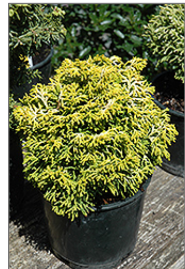
Butterball Hinoki Falsecypress