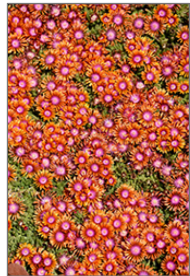
Fire Spinner Ice Plant flowers