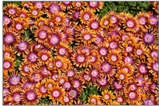
Fire Spinner Ice Plant in bloom

Fire Spinner Ice Plant is recommended for the following landscape applications;