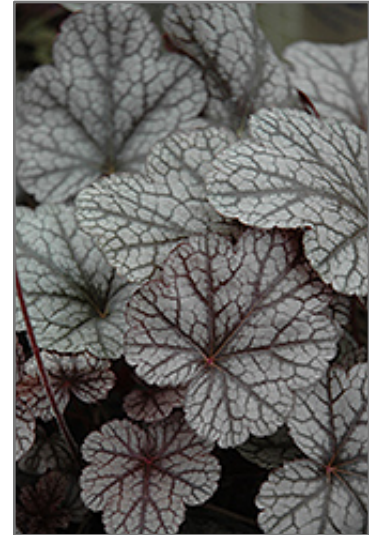
Prince Of Silver Coral Bells foliage