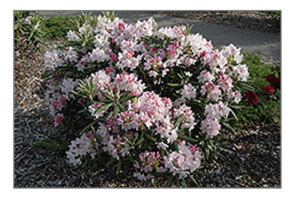
Mikkeli Rhododendron in bloom