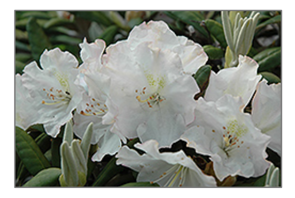
Mikkeli Rhododendron flowers