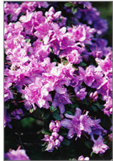
Ramapo Rhododendron flowers