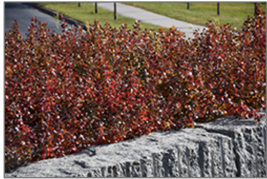
Gro-Low Fragrant Sumac in fall

This shrub performs well in both full sun and full shade. It is very adaptable to both dry and moist locations, and should do just fine under typical garden conditions. It is not particular as to soil type, but has a definite preference for acidic soils, and is subject to chlorosis (yellowing) of the foliage in alkaline soils. It is highly tolerant of urban pollution and will even thrive in inner city environments. Consider applying a thick mulch around the root zone in winter to protect it in exposed locations or colder microclimates. This is a selection of a native North American species.