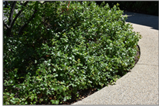
Gro-Low Fragrant Sumac

Gro-Low Fragrant Sumac is recommended for the following landscape applications;