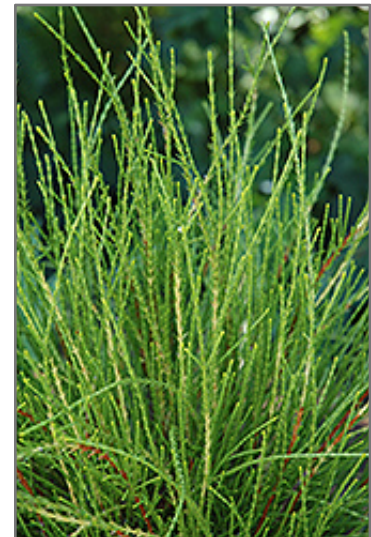
Franky Boy Arborvitae foliage