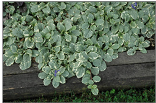
Silver Queen Bugleweed