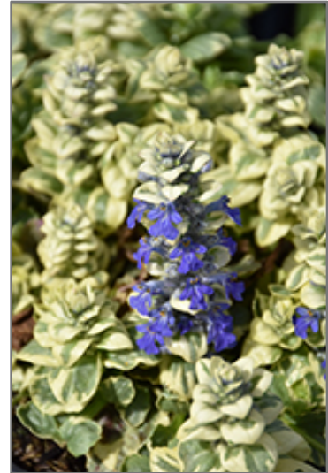
Silver Queen Bugleweed flowers

Silver Queen Bugleweed is a dense herbaceous evergreen perennial with a ground-hugging habit of growth. Its medium texture blends into the garden, but can always be balanced by a couple of finer or coarser plants for an effective composition.