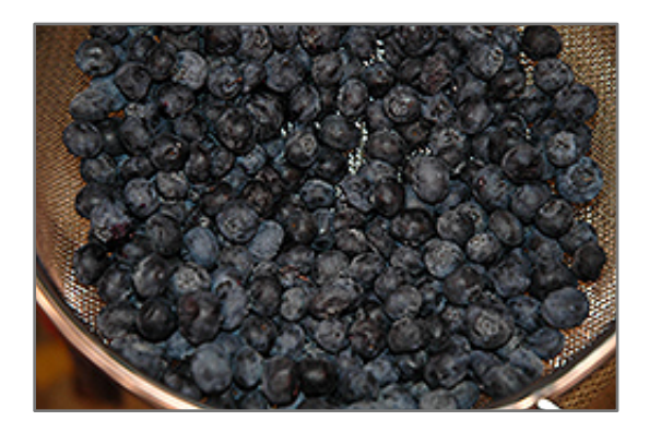
Brigitta Blueberry fruit

CustomerCare@WestonNurseries.com 93 East Main Street Hopkinton MA 02148 - (508) 435-3414 160 Pine Hill Road Chelmsford MA 01824 - (978) 349-0055 COMMERCIAL: commsales@westonnurseries.com - (508) 293-8028