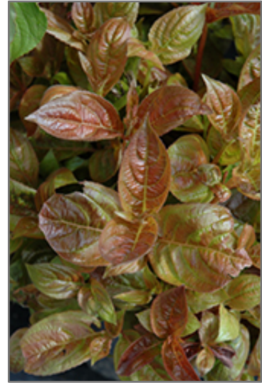
Wings Of Fire Weigela foliage