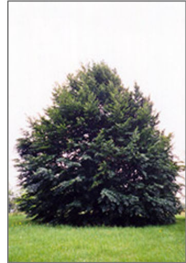
European Beech