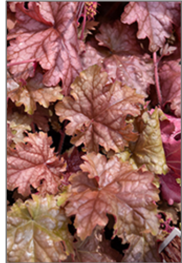
Carnival Peach Parfait Coral Bells foliage

Carnival Peach Parfait Coral Bells is recommended for the following landscape applications;