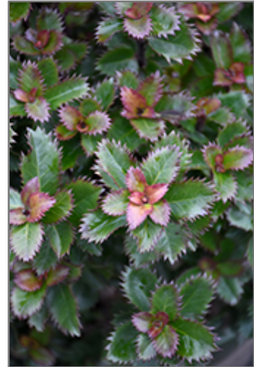
Scallywag Holly foliage