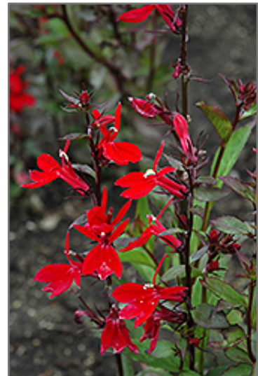
Fan Scarlet Cardinal Flower flowers