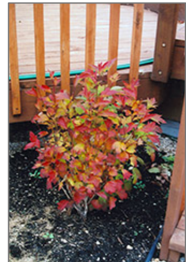
Compact Highbush Cranberry in fall