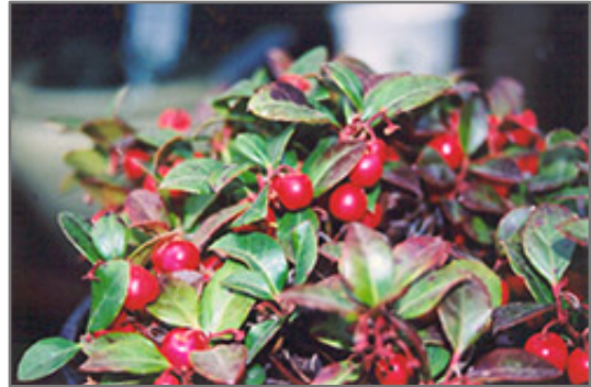
Creeping Wintergreen fruit

Creeping Wintergreen is recommended for the following landscape applications;