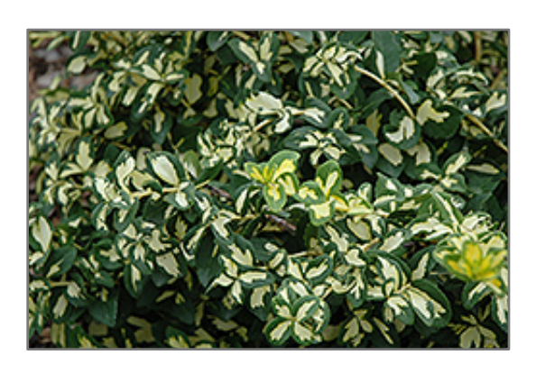
Moonshadow Wintercreeper foliage