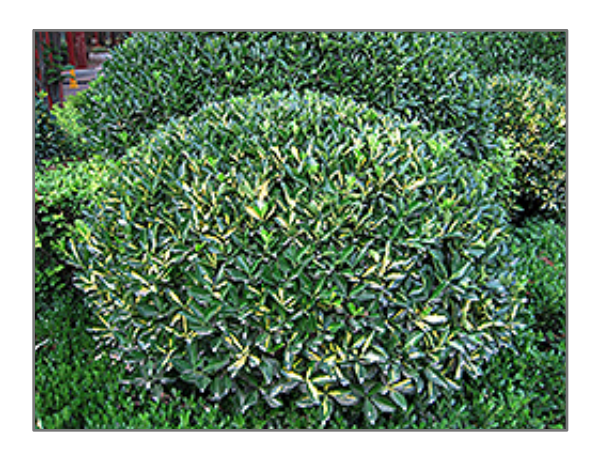
Moonshadow Wintercreeper