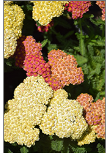
Desert Eve Terracotta Yarrow flowers

Desert Eve Terracotta Yarrow is recommended for the following landscape applications;