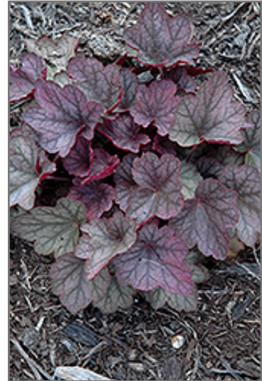
Carnival Rose Granita Coral Bells foliage

Carnival Rose Granita Coral Bells is recommended for the following landscape applications;