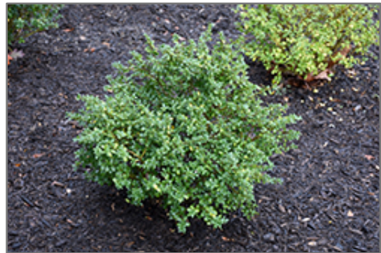
Green Lustre Japanese Holly