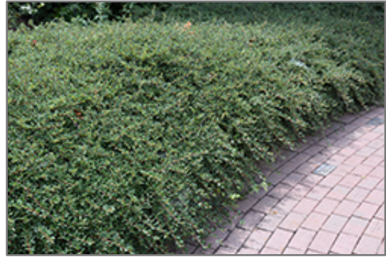
Coral Beauty Cotoneaster