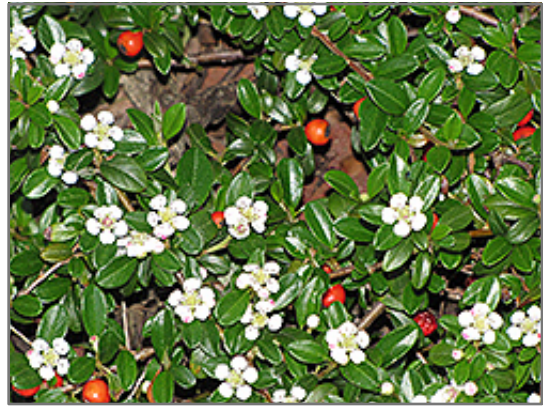
Coral Beauty Cotoneaster fruit

Coral Beauty Cotoneaster will grow to be about 12 inches tall at maturity, with a spread of 5 feet. It tends to fill out right to the ground and therefore doesn't necessarily require facer plants in front. It grows at a fast rate, and under ideal conditions can be expected to live for approximately 30 years.