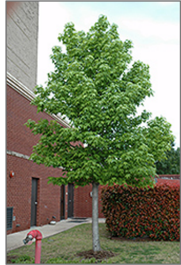
Happidaze Sweet Gum

This tree should only be grown in full sunlight. It prefers to grow in average to moist conditions, and shouldn't be allowed to dry out. It is very fussy about its soil conditions and must have rich, acidic soils to ensure success, and is subject to chlorosis (yellowing) of the foliage in alkaline soils. It is somewhat tolerant of urban pollution. This is a selection of a native North American species.