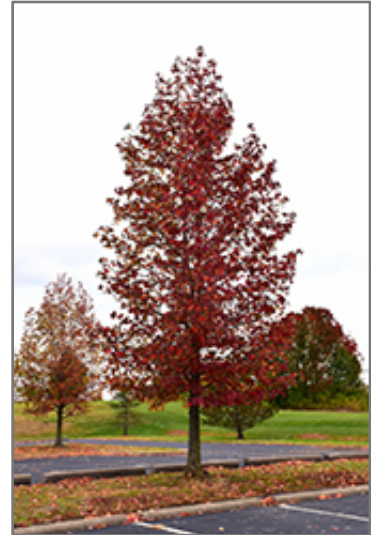
Happidaze Sweet Gum in fall