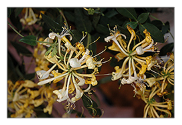
Scentsation Honeysuckle flowers

93 East Main Street Hopkinton MA 02148 - (508) 435-3414 160 Pine Hill Road Chelmsford MA 01824 - (978) 349-0055 COMMERCIAL: commsales@westonnurseries.com - (508) 293-8028