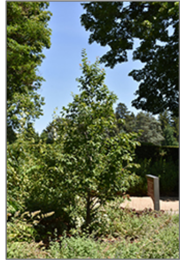
Firespire American Hornbeam

This tree performs well in both full sun and full shade. It is an amazingly adaptable plant, tolerating both dry conditions and even some standing water. It is not particular as to soil type or pH. It is somewhat tolerant of urban pollution. This is a selection of a native North American species.