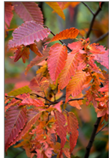
Firespire American Hornbeam in fall