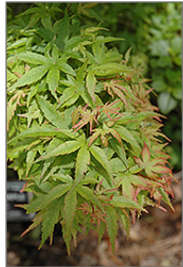
Sharp's Pygmy Japanese Maple foliage