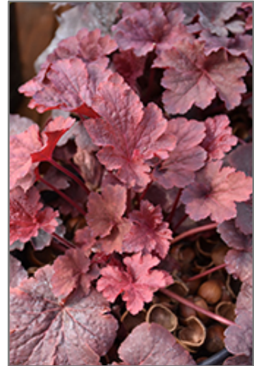
Cajun Fire Coral Bells foliage

Cajun Fire Coral Bells is recommended for the following landscape applications;