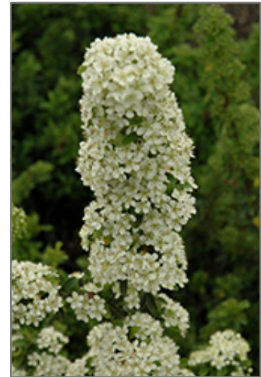
Teton Scarlet Firethorn flowers

Teton Scarlet Firethorn is recommended for the following landscape applications;