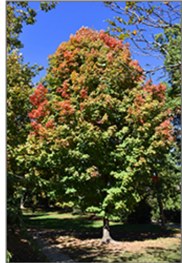
Endowment Sugar Maple