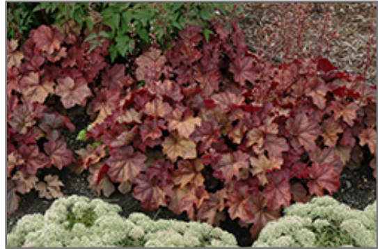
Lava Lamp Coral Bells

Lava Lamp Coral Bells is a fine choice for the garden, but it is also a good selection for planting in outdoor pots and containers. With its upright habit of growth, it is best suited for use as a 'thriller' in the 'spiller-thriller-filler' container combination; plant it near the center of the pot, surrounded by smaller plants and those that spill over the edges. Note that when growing plants in outdoor containers and baskets, they may require more frequent waterings than they would in the yard or garden.