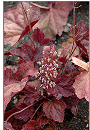
Lava Lamp Coral Bells flowers