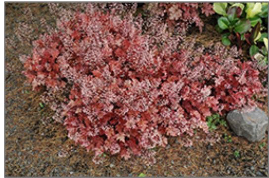
Peach Crisp Coral Bells in bloom

Peach Crisp Coral Bells is recommended for the following landscape applications;