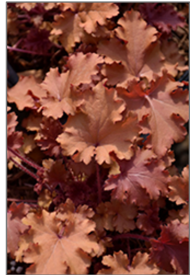
Peach Crisp Coral Bells foliage

Peach Crisp Coral Bells will grow to be about 14 inches tall at maturity extending to 20 inches tall with the flowers, with a spread of 18 inches. When grown in masses or used as a bedding plant, individual plants should be spaced approximately 15 inches apart. Its foliage tends to remain dense right to the ground, not requiring facer plants in front. It grows at a medium rate, and under ideal conditions can be expected to live for approximately 10 years. As an evergreen perennial, this plant will typically keep its form and foliage year-round.