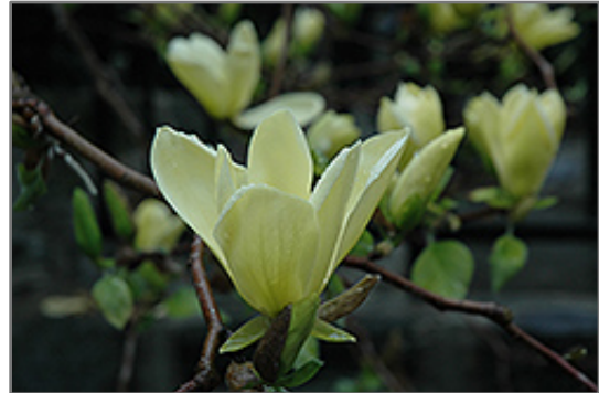
Golden Gift Magnolia flowers

Golden Gift Magnolia will grow to be about 25 feet tall at maturity, with a spread of 20 feet. It has a low canopy with a typical clearance of 2 feet from the ground, and is suitable for planting under power lines. It grows at a medium rate, and under ideal conditions can be expected to live for 50 years or more.