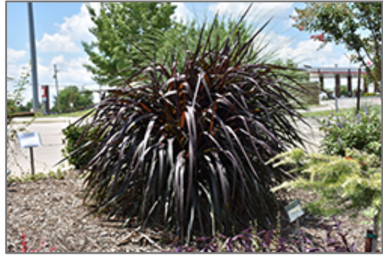
Princess Caroline Fountain Grass

Princess Caroline Fountain Grass is recommended for the following landscape applications;