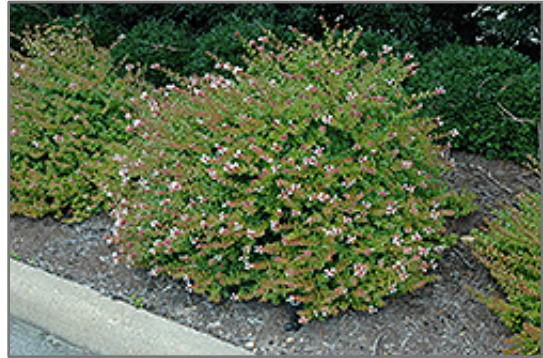
Rose Creek Abelia in bloom

Rose Creek Abelia is recommended for the following landscape applications;