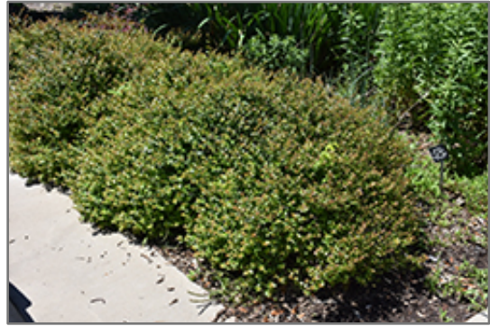
Rose Creek Abelia

Rose Creek Abelia makes a fine choice for the outdoor landscape, but it is also well-suited for use in outdoor pots and containers. Because of its height, it is often used as a 'thriller' in the 'spiller-thriller-filler' container combination; plant it near the center of the pot, surrounded by smaller plants and those that spill over the edges. It is even sizeable enough that it can be grown alone in a suitable container. Note that when grown in a container, it may not perform exactly as indicated on the tag - this is to be expected. Also note that when growing plants in outdoor containers and baskets, they may require more frequent waterings than they would in the yard or garden.