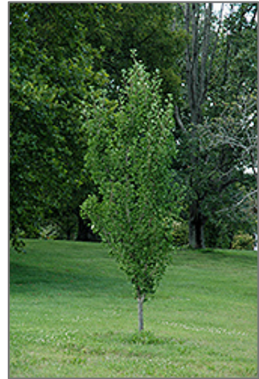
Presidential Gold Ginkgo