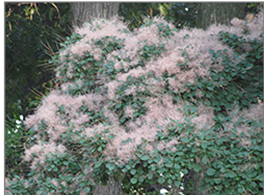
American Smoketree in bloom