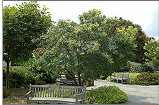
American Smoketree in bloom

American Smoketree is recommended for the following landscape applications;