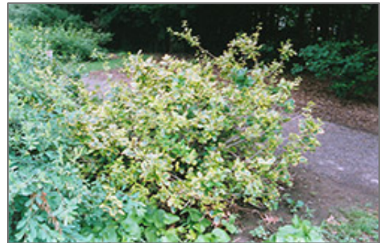
E.T. Gold Wintercreeper