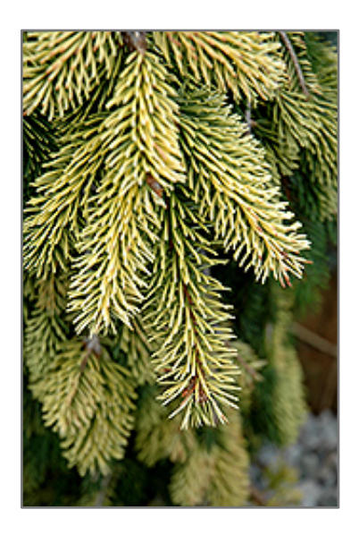
Gold Drift Norway Spruce foliage