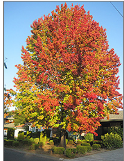
Lane RobertsSweet Gum in fall

Lane RobertsSweet Gum is recommended for the following landscape applications;