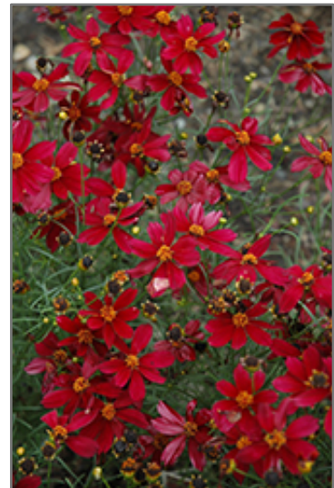
Red Satin Tickseed in bloom