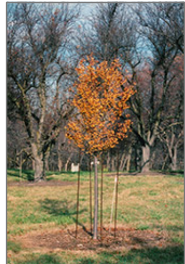
Lancelot Flowering Crab fruit