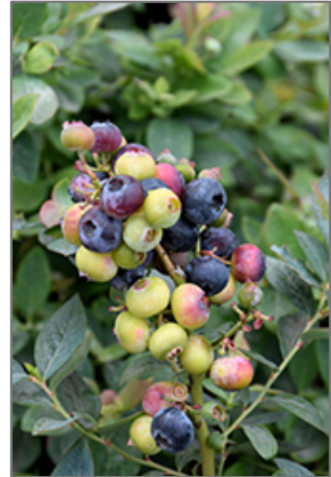
Pink Icing Blueberry fruit

Pink Icing Blueberry features dainty clusters of white bell-shaped flowers with shell pink overtones hanging below the branches in mid spring, which emerge from distinctive pink flower buds. It has bluish-green deciduous foliage which emerges pink in spring. The glossy oval leaves turn an outstanding aqua bluish-green in the fall. It features an abundance of magnificent blue berries in mid summer.