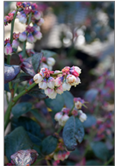
Pink Icing Blueberry flowers

This shrub is quite ornamental as well as edible, and is as much at home in a landscape or flower garden as it is in a designated edibles garden. It does best in full sun to partial shade. It does best in average to evenly moist conditions, but will not tolerate standing water. It is very fussy about its soil conditions and must have sandy, acidic soils to ensure success, and is subject to chlorosis (yellowing) of the foliage in alkaline soils. It is quite intolerant of urban pollution, therefore inner city or urban streetside plantings are best avoided, and will benefit from being planted in a relatively sheltered location. Consider applying a thick mulch around the root zone in winter to protect it in exposed locations or colder microclimates. This particular variety is an interspecific hybrid.